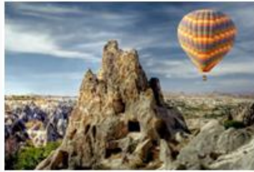
DAILY CAPPADOCIA TOUR