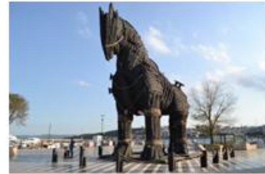
GALLIPOLI AND TROY TOUR