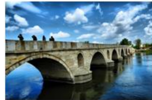
DAILY EDIRNE TOUR