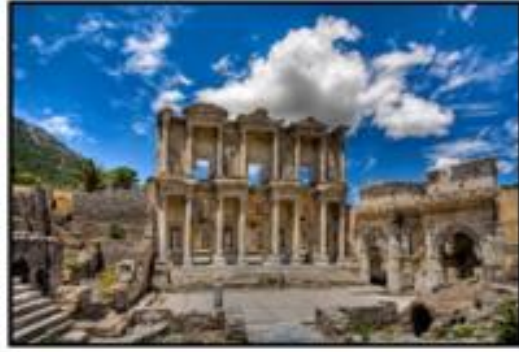
DAILY EPHESUS TOUR