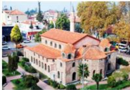
DAILY IZNIK TOUR